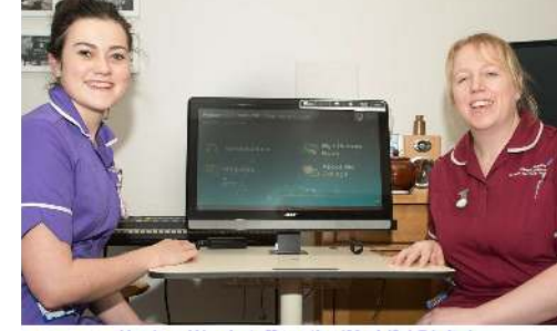
Hoskyn Ward staff try the 'My Life' Digital Reminiscence System in the Bluebell Lounge