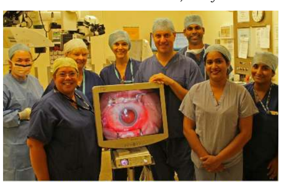
The Opthalmology Surgical team with their new video equipment.

The volunteering side of the charity continues to be well supported, with more volunteer applications coming from new contacts. This, we suspect, is due to the increased profile of the charity in the local media - thanks to the efforts of our Communications Officer, Willy Goldschmidt. Our volunteers, totalling over