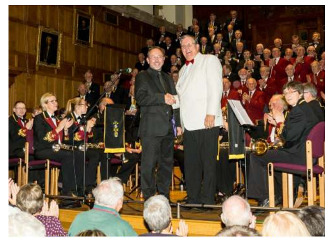
The musical directors congratulate each other, after our gala concert!

Income from the Tea Bar covers all our administration, publicity and insurance costs - and leaves a large surplus. This means that 100% of all donations and gifts, is spent on equipment for the hospital, and for community health and mental health services.