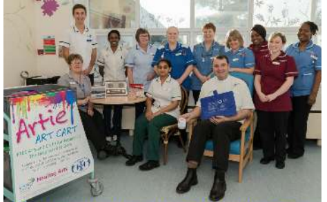
The Mulberry Ward team, in the Rehabilitation Centre, with various donations.