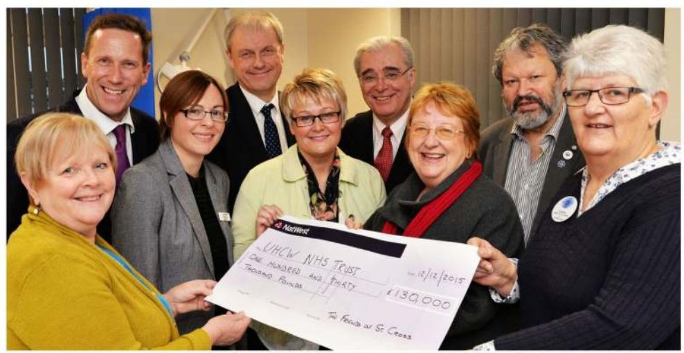
Trustees present the Trust with a cheque towards the cost of refurbishing and re-equipping the old Mulberry Ward, which is the location of the new Friends Blood-Taking Unit.

Front cover photo: The Phlebotomy Team visited the Friends Blood-Taking Unit, before it opened, in December.