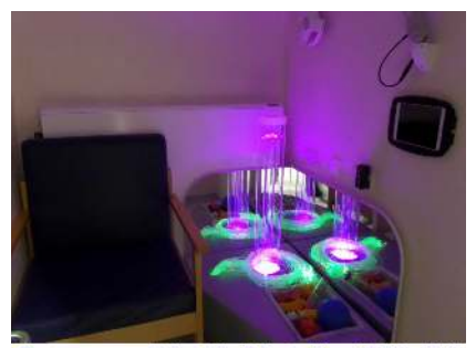
The sensory cubicle in the Friends Blood-Taking Unit.

requests, throughout the year, costing another £51,100. We have provided a video camera for ophthalmology operations - which has helped expand the range of operations undertaken at St. Cross - supplied equipment for the children's outpatient clinics, and various beds and chairs, which improve patient comfort, as well as sensory mats - which alert staff if a patient is trying to get out of a chair or bed unaided.