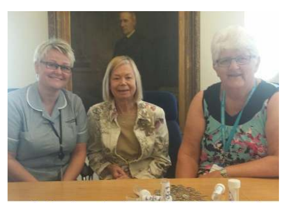
Celebrating collecting over £2,500 in 5p pieces!

For the first time in recent years, supporters took on a variety of sponsored activities, including the Three Peaks Challenge, several half marathons, a sponsored abseil and the somewhat gentler Jingle Jog!