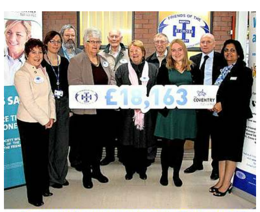
Coventry cheque presentation.

As well as the appeal, we have income from a number of regular sources, which continue to go from strength to strength. These include the Tea Bar, Outpatients Book Sales, and the donation from the Coventry Building Society, in respect of the St. Cross Saver Account; which totalled £18,163 this year!