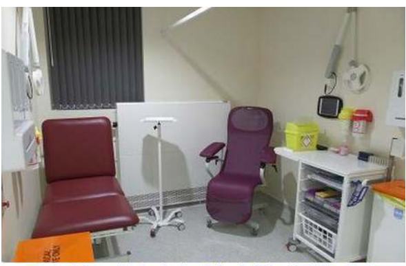
One of the cubicles in the Friends Blood-Taking Unit.

The new blood-taking unit operational became on December 14th, and has made a significant difference to the patient experience. Enjoying working in the muchwhilst improved facility, increased coping with