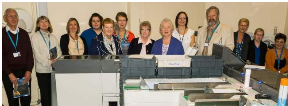
The team who helped the Bowel Screening Programme on a tour of the BSP facility.

In November 2016, the Charity committed £80,000 to support a project for 2017 which will bring a NEW service for the West Midlands, to St. Cross! The project will deliver a 'gold standard', comprehensive neurological sleep medicine service, close to where patients live, further reinforcing the importance of St. Cross in the Coventry and Warwickshire health economy!