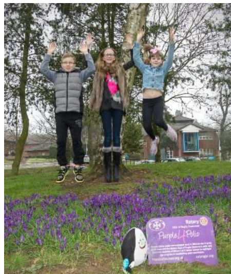
Pupils from Bilton C of E Junior School planted purple crocuses as part of the Rotary campaign to eradicate Polio.