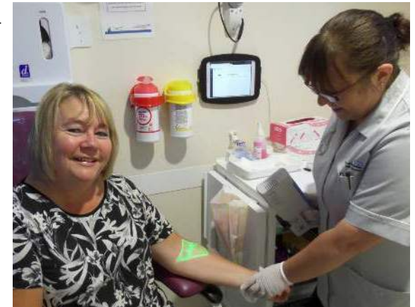
Vein viewer, for Friends Blood-Taking Unit.

These awards were the 'icing on the cake' of two years of celebrations, which started in 2014 - with a Special Award at the Pride of Rugby ceremony - and, of course, the Queen's Award for Voluntary Service. This continued with the celebration of our Diamond Jubilee, and the success of both the Diamond Jubilee Appeal, and the delivery of the re-located and re-equipped Blood-Taking Unit at St. Cross, which opened in December 2015.