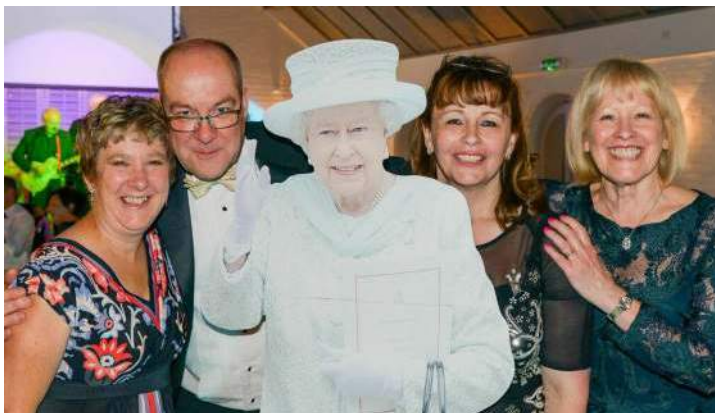
Black Tie Summer Ball - with a special guest stand-in!