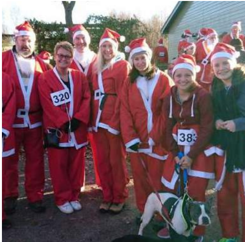
Sponsored fund raisers, before the 'Jingle Jog'.