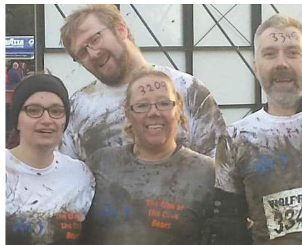
Sponsored fundraisers after the Wolf Run.