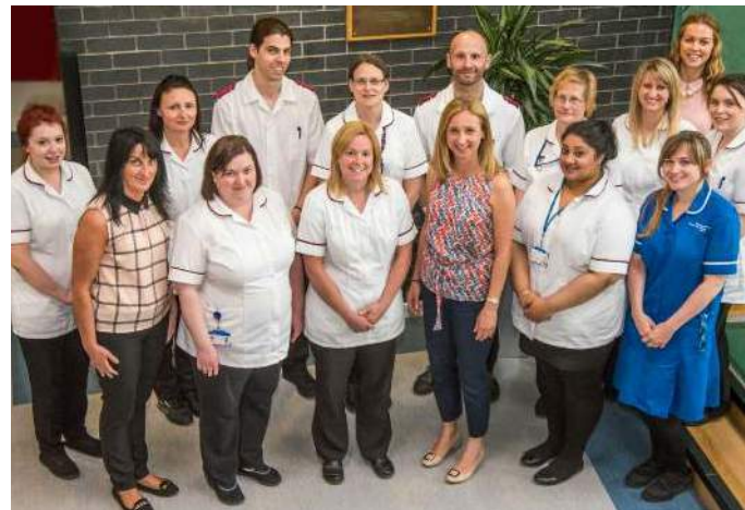
The Sleep Physiology Team.

This service is particularly important for people in the transport industry, who require regular medicals, and can lose income until their sleep disorders are treated. Currently patients are referred to Leicester General and Birmingham Heartlands hospitals, where they can wait up to six months to be seen!