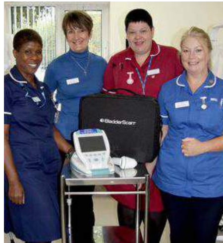
Epilepsy monitor for the Community Service.

To find out more about volunteering, call us on 01788 663754 - or look up the 'for volunteers' section of our website, at www.fsx.org.uk