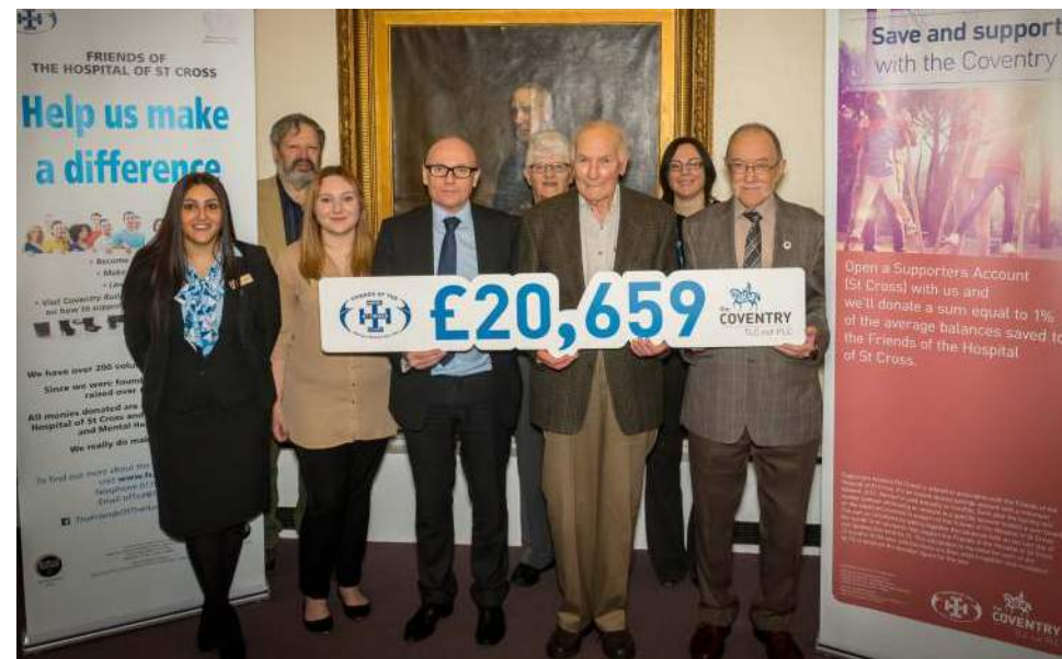
The Coventry Building Society donation.