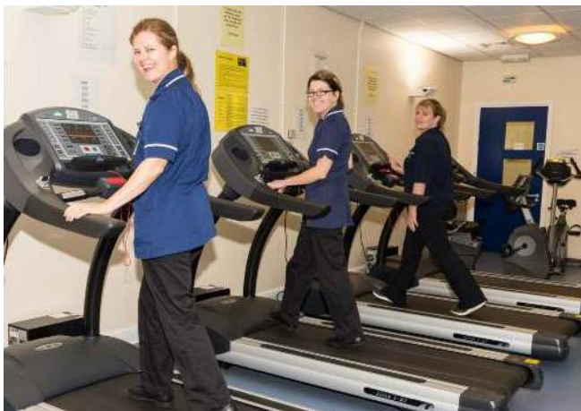
Treadmills for Cardiac Rehab.