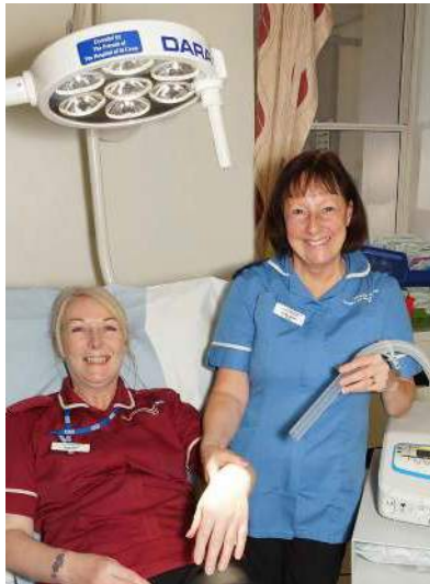
Special equipment for dermatology procedures.

To find out more about volunteering, call us on 01788 663754 - or look up the 'for volunteers' section of our website, at www.fsx.org.uk