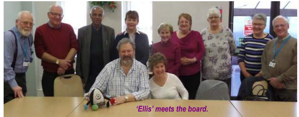
'Ellis' meets the board.