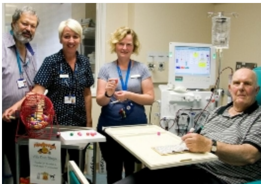
A new bingo cage and accessories have brought a smile to the faces of all who get to shout 'house!'

In November and December we ran a Festive Befriending initiative, which was themed around "no-one should be alone at Christmas". The idea was developed with the help of the Modern Matrons, and we appealed to the community in Rugby to visit patients who would unfortunately not be well enough to be discharged home before Christmas. 50 members of the public responded, and made over 100 visits to the hospital between Christmas and New Year. The initiative was acclaimed as an outstanding success by patients, staff and volunteers - many of whom signed up to repeat the exercise this December, and some have joined the Friends as regular volunteers.