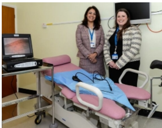
The new Outpatient Cystoscopy Urogynaecology Service (FOCUS) equipment in the Owen Building.

An exciting new service for the whole of Warwickshire has been created, thanks to a Friends donation of the specialist equipment needed to establish a Flexible Outpatient Cystoscopy Urogynaecology Service (FOCUS) in the Owen Building, at St. Cross. Until now, patients had to travel to University Hospital, in Coventry, for a procedure that requires general anaesthesia and an overnight stay in hospital. The new service in Rugby will introduce