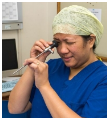
New arthroscopes enable St. Cross surgeons to examine hip joints more closely.

The new arthroscopes are connected to high-definition screens, and have internal mirrors which enable the surgeons to look at the joint, using either 30 or 70 degree angles, from the tip of the scope. They allow our surgeons to create highly detailed images of the hip joint's surface, and repair the problems causing our patient's pain. We're very grateful for the donation to help our patients.