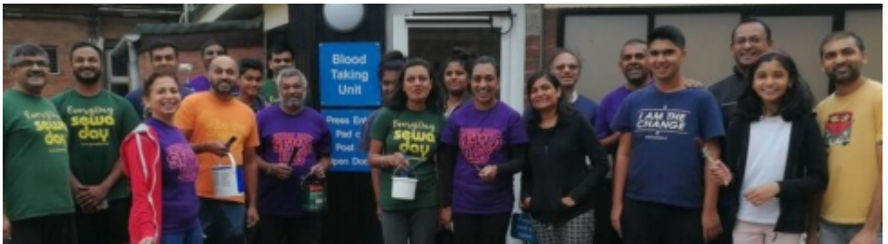
Members of the Rugby branch of Hindu Swayamsevak Sangh (UK) help St. Cross on 'Sewa Day'!

To find out more about volunteering, call us on 01788 663754 or look up the 'for volunteers' section of our website, at www.fsx.org.uk