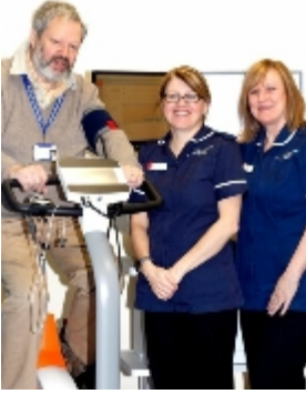
The latest Cardio Pulmonary Exercising Testing equipment in the Rehab Gym.

The Friends have been proud to support the Cardiac Rehab team at the Hospital of St. Cross for many years, and have provided the majority of the equipment used in the Rehab Gym. So when the Board heard that the equipment - used to assess patients, at the start of their rehabilitation - was 15 years old, and becoming a problem to maintain, there was no hesitation in approving a request to spend £40,000 on the latest Cardio-Pulmonary Exercising Testing (CPET) equipment. In addition to assessments undertaken by patients at the start of their rehab after a 'heart event', this equipment can be used to assess patients prior to transplants, as part of a research study that the team, and some of their patients, are taking part in.