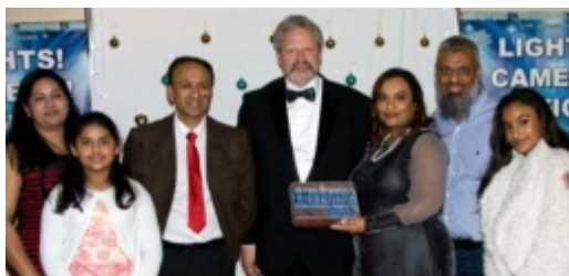
At the Shree Prajapati Association dinner and dance.

the incidence of cataracts is particularly high in their community.