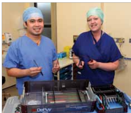
Arthroscopy instruments

Donations which we have made to help achieve this are a set of specialist arthroscopy instruments, which help stabilise shoulder joints, and iliac supports which are used to secure patients who are having hip surgery. The supports are fully adjustable, were specially designed by the local surgeons and are a great improvement on the fixed supports that were used before!