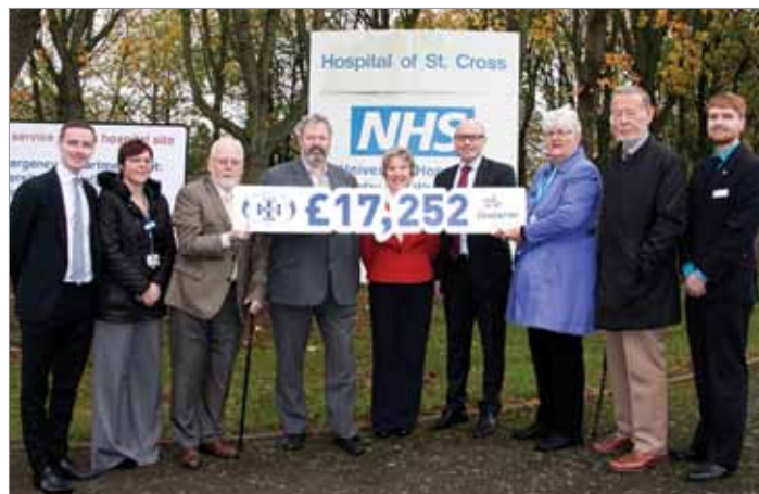
Representatives of the Coventry, the hospital and the charity at the cheque handover

Last November we were delighted to receive the latest donation from the Coventry which was over £2,000 more than in 2013 which means that the St Cross saver Account has increased in its popularity.