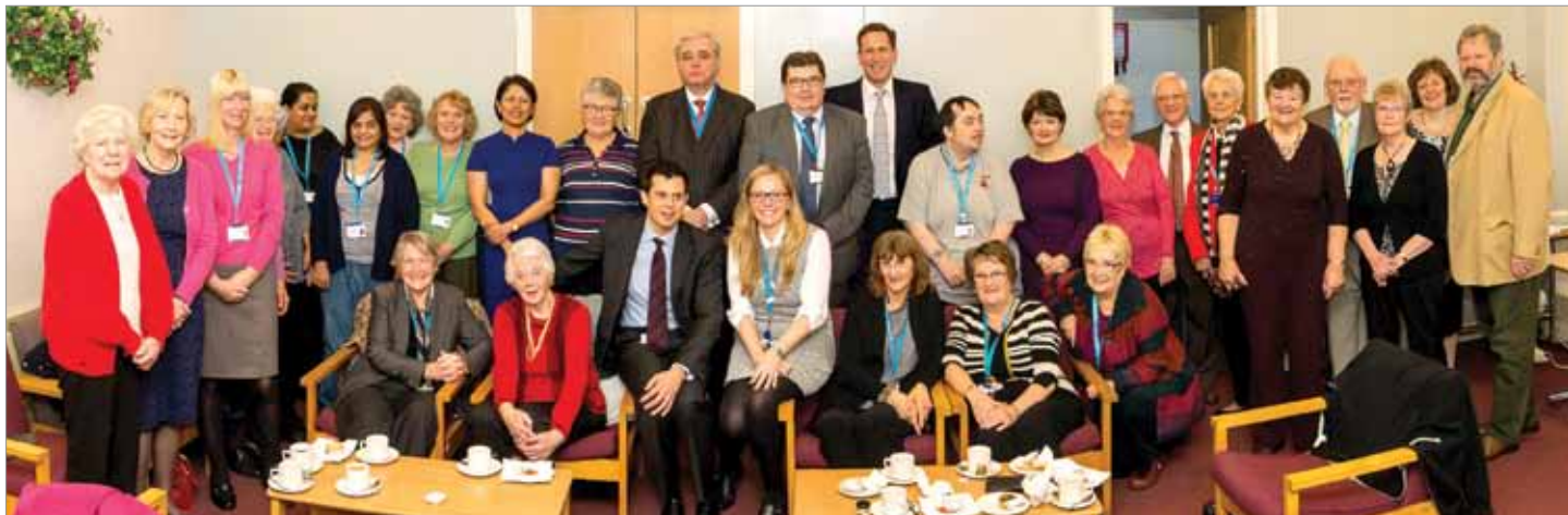
Volunteers and Executives from University Hospitals of Coventry and Warwickshire NHS Trust

The Chairman, Chief Executive Officer and three members of the Executive team from UHCW hosted a coffee morning just before Christmas to thank volunteers from the Friends of St Cross, Rugby Hospital Radio and the team of other hospital volunteers for their dedication and the great range of services they have provided over this and previous years at the Hospital of St Cross.