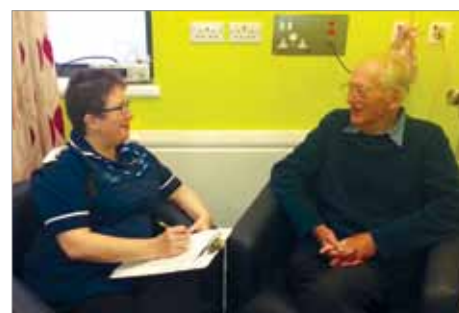
Tub chairs for the Urgent Care Centre

New 'tub chairs' have also been delivered to the Urgent Care Centre. These are more comfortable than treatment trolleys for patients waiting for assessment or transport. Two of them are located in a side room which provides a better setting for holding sensitive conversations.