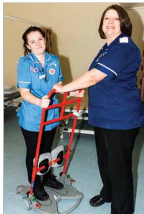
Patient turners

New 'tub chairs' have also been delivered to the Urgent Care Centre. These are more comfortable than treatment trolleys for patients waiting for assessment or transport. Two of them are located in a side room which provides a better setting for holding sensitive conversations.