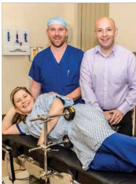
Iliac supports - Photo by Bob Mercer*

Also pictured is one of two new patient supports for Oak Ward, which are of the same as those issued by Warwickshire County Council's Equipment Service, and are used to help patients and their carers become familiar with the aids before going home.