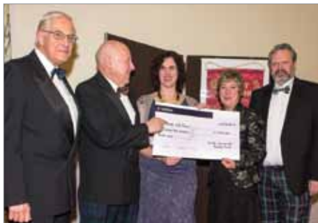
Rotary Cheque Presentation - Photo by Eddie White*

By the end of February we had received over £46,000 and decided that we would hold back on publishing updates on progress until the AGM which will be held, for the first time, in the Benn Hall in order to accommodate what we hope will be a larger than normal attendance – see overleaf for details!