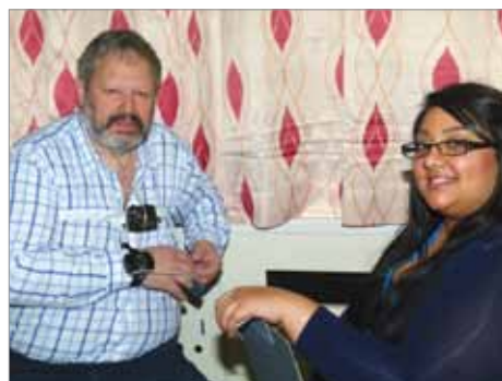
Sleep Apnoea diagnostic equipment

The Friends have helped bring a new service to the Hospital of St Cross for patients suffering from sleep disorders. The diagnostic device that we donated is a lot smaller than earlier models and has made domiciliary sleep studies much easier to tolerate. Used for the detection of Obstructive Sleep Apnoea (OSA), the equipment is taken home by the patient, and worn in the comfort of their own home.