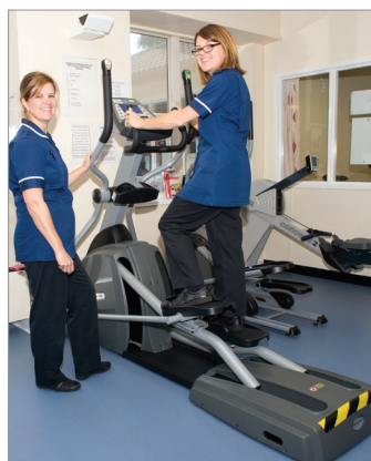
Crosstrainer for Cardiac Rehab