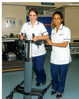
Atlas Frames for Oak & Cedar Rehab