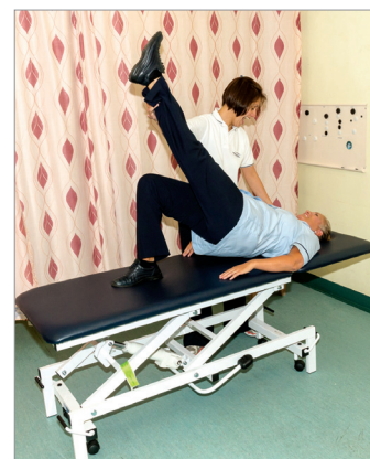
Physiotherapy Plinths for Out Patients