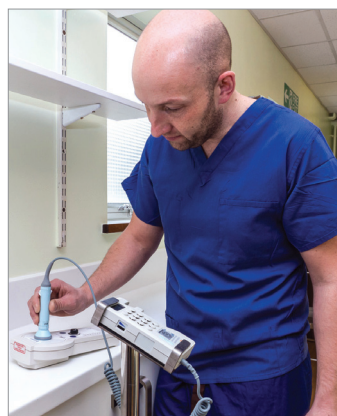
Foetal Heart Monitor Calibrator

patients in Rugby. More details about these and other donations are published on our refreshed website – www.friendsofstcross.org.uk !