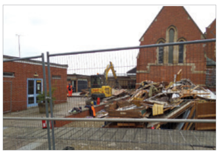
The Portakabin next to the Chapel has gone!