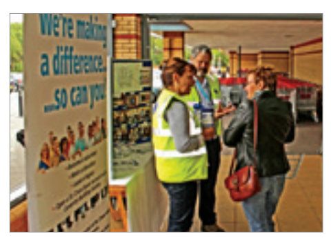
In store collection at Sainsbury's by George Ballard