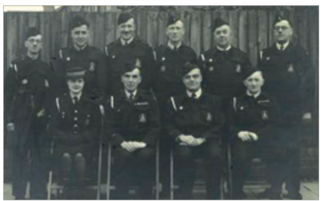
The Coventry Fire Guard instructors, 1944