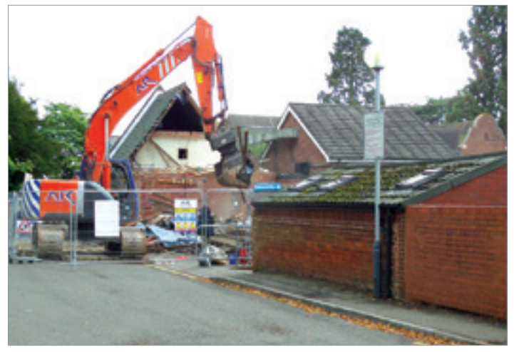
Demolition of the CSSD building on 15th September

Parking for the new unit will be on the top/North Road – currently